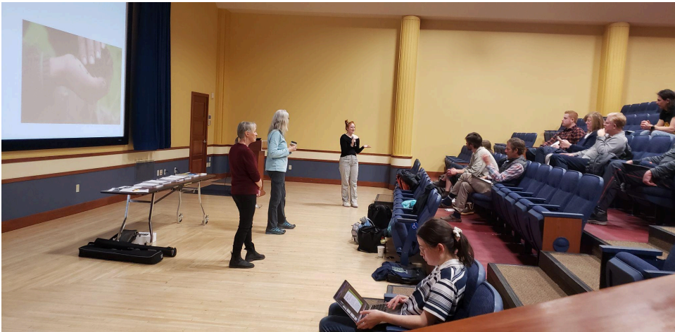
Members speak at the American Institute of Chemical Engineers (AIChE) Climate Conference.

Courses and classes like these ensure that health professionals of tomorrow are prepared for the novel health challenges of climate change.