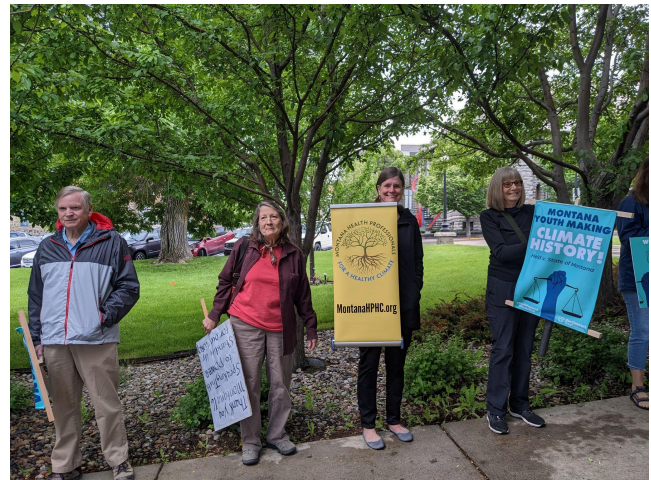
Left: Climate Health banners displayed with Our Children's Trust, the nonprofit legal team who represented the Held v. Montana plaintiffs. Right: MTHPHC members cheered on plaintiffs as they entered the courtroom every day of the trial.