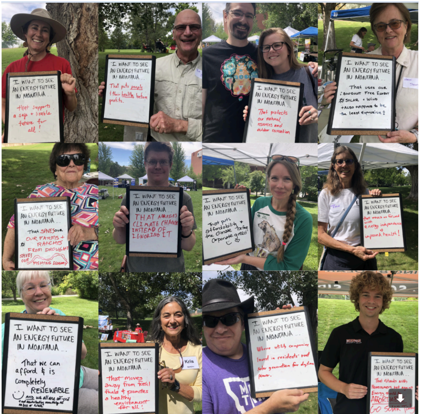
Folks share their visions for the future of Montana's energy at the Billings Clean Energy fair.