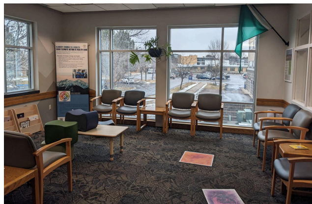
Banners and air quality flag at the Western Montana Clinic in Missoula, 1/24.

Last year, we developed a series of floor-standing banners for patient education. This year, they've done a circuit of eleven clinics and hospitals, from Missoula to Miles City! Riverstone Health Clinic was even inspired to create their own set of banners for permanent display. We also took copies of the banners to tabling events across the state (see the tabling section above). The banners explain the basics of climate's effects on our lungs, our pregnancies, our body temperature regulation, and more.