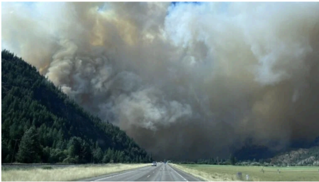
In this photo from Aug. 18, 2023, smoke from the River Road East Fire fills the air in western Montana. After sparking 6 miles east of Plains, the fire ultimately destroyed 64 structures and grew to more than 17,000 acres, making it the second-largest wildfire of the 2023 season.

HANNAH MARK For Lee Montana Newspapers Jan 6, 2025