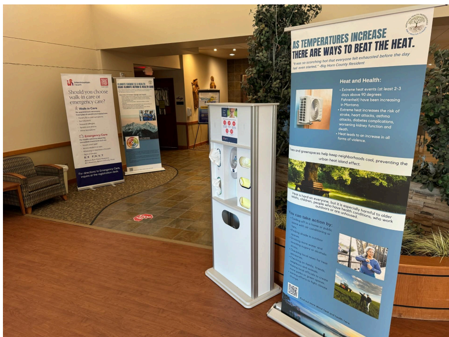
Banners at Holy Rosary Hospital in Miles City, MT, 7/24.