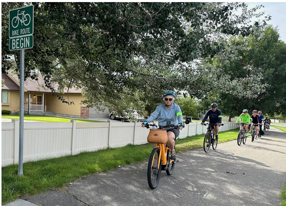
Members bike in our annual Ride for Their Lives, 9/14/24.