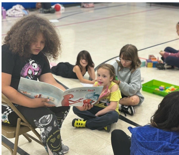
Boys & Girls Club member reading the EPA's book on Air Quality Flags ("Why is Coco Red?") to fellow club members, 4/28/24.

We tabled at thirteen different events this year to promote climate health solutions. Volunteers handed out educational materials and answered questions about how to stay healthy during extreme heat, smoke, drought, and more. We nearly doubled our tabling events from last year thanks to our growing partnerships, especially among agricultural organizations. Thank you to everyone who hosted us!