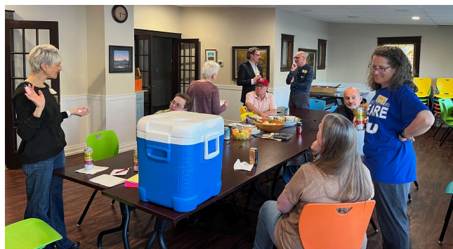
Climate Health Stewards gather after our conference, 4/13/24.